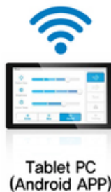
Tablet PC (Android APP)