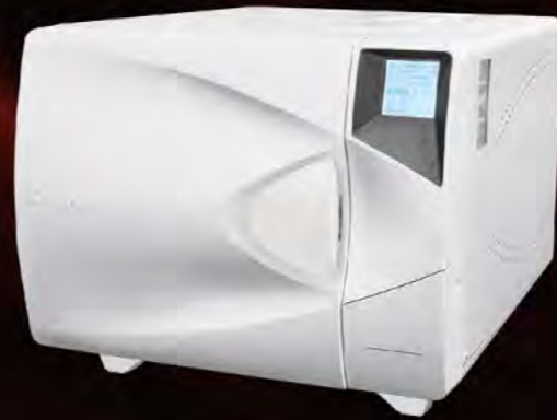
60/80L inductive operation