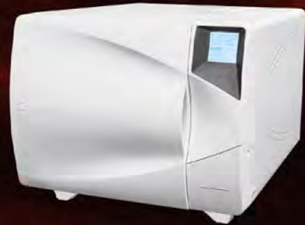
18/24/45L inductive operation