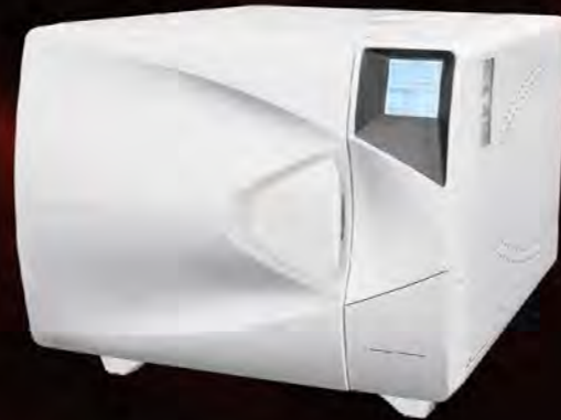
80L inductive operation