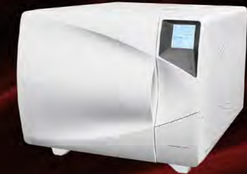
29L inductive operation