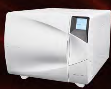
24/45L inductive operation