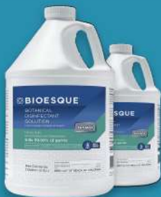
PRODUCT CODES: BBDSQ & BBDSG