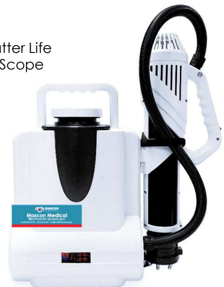
PRODUCT CODE: MMD227