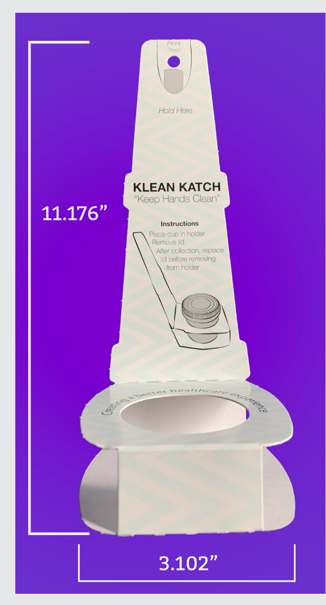
This is the Klean Katch Holder Fully Un-Folded and ready to be used by patient.

Klean Katch Details Item Number KK001-50ST