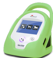
Tree Frog Green